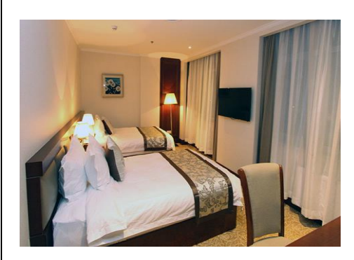
the rooms at 12:00M.

The Premium Hotel is located 20 min. walking distance from Gandan Monastery - the most important in Mongolia, and 2.3 km from Sukhbaatar Central Square and 52 kms/32.31 miles (2 hours driving) "Chinggis Khaan" international new airport The Premium Palace hotel has 192 rooms, elevators, 2 restaurants: Yu Long Chino, and buffet breakfast, number floors: 20, WIFI, gym, CU cafeteria on the 1st floor, and small parking lot. Check-in from 2:00 p.m. Check out of the rooms at 12:00M.