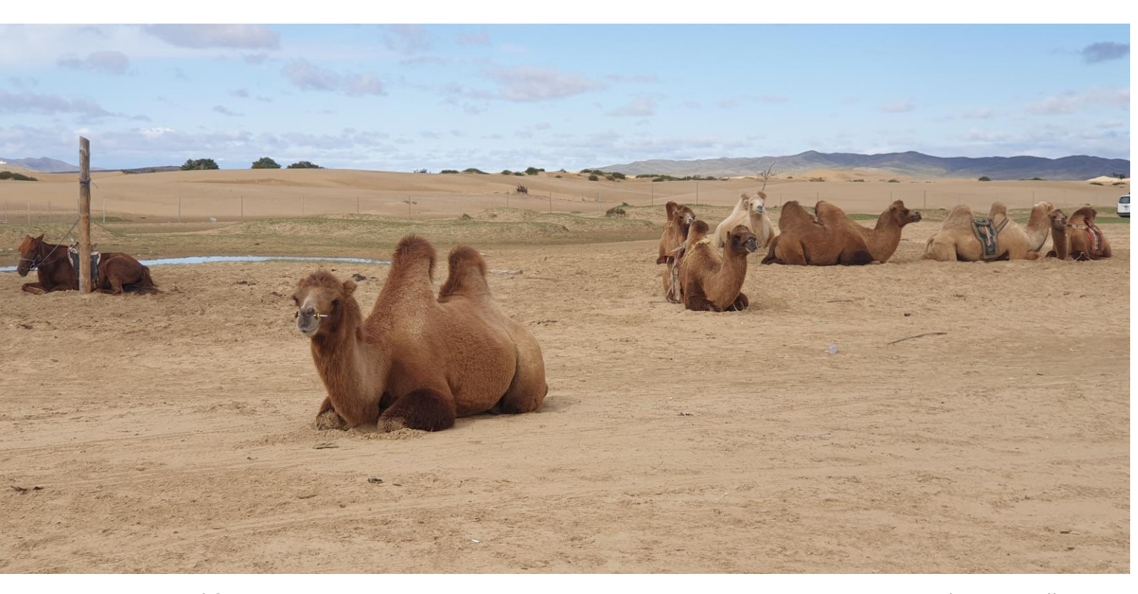
Day 4-Breakfast. 09:00AM-Meet Samar Magic Tours team at reception of the hotel. Today, we will head west to Elsen Tasarkhai Dunes (known as the Bayangobi desert or MiniGobi, about 280 km/174 miles, +4hours drive), desert sand dunes spread over 80kms in a beautiful valley. Opportunity for hiking, walking through the dunes, and photographing the landscapes. Excursion included to cross the dunes on the back of a Bactrian camel. Continuous drive to Karakorum (about 150 km/94 miles, 2 hrs) in Central Mongolia-the Genghis (Chinggis) Khan's 13th century capital and heart of the mighty Mongolian Empire and Okhon river Valley, cradle of Mongolian civilization. Visitors, such as Marco Polo, described its ornate building, including a 2500 sq. meters Palace of Worldly Peace. Free time at your leisure, for walks through the Orkhon River Valley or rest. Overnight in Tourist Gers Camp. (B)(L)(D)